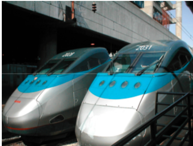
Figure 2. High-Speed Train (Amtrak Acela Train).

where a(t) = \frac{dV}{dt} is the rate of change of velocity over time (m/s-s) - acceleration, V is the train speed in m/s and k_1, k_2 are two constants that relate the acceleration of the train as a function of speed. For a High-Speed train the values of k_1 is 2.1 (m/s-s) and k_2 = 0.023 (1/second).