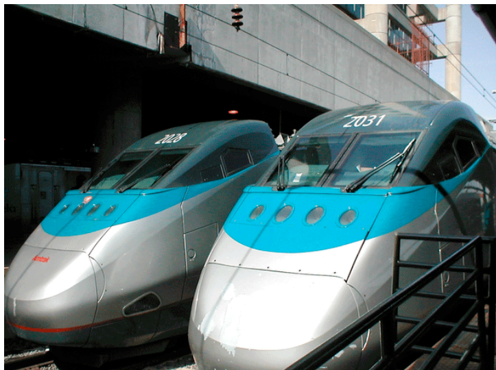
Figure 4. Acela High-Speed Trains.