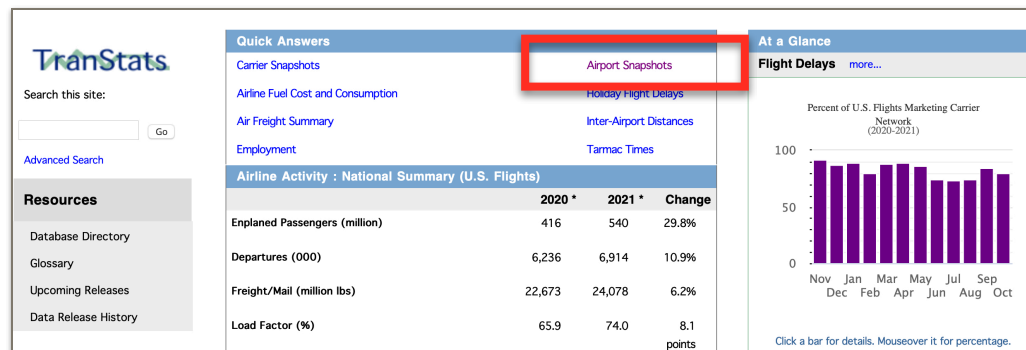
Figure 1. Front Page of Transportation Statistics Database ( https://www.transtats.bts.gov ).