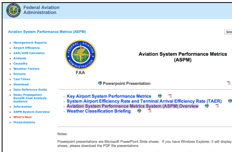
Figure 1. Aviation System Performance Metrics (ASPM) Presentations Window.

Before doing this problem please read the presentation entitled "Aviation System Performance Metrics (ASPM) Overview" posted at the ASPM Complete web site (see Figure 1).